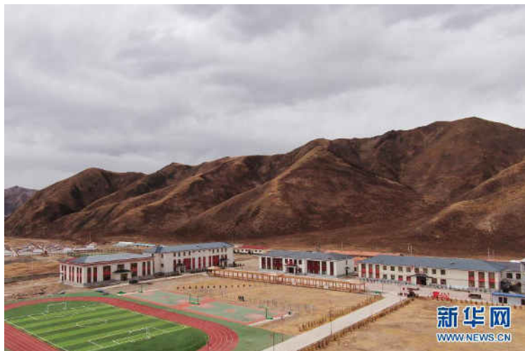
A rural primary school in Qinghai Province