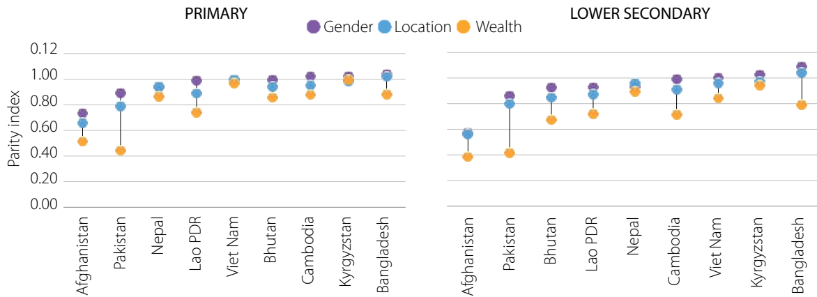
FIGURE 1: Parity index, adjust net attendance rate, 2014 or latest

Note: Data for Kyrgyzstan refer to 2006. Data for Bhutan refer to 2010. Data for Afghanistan, Bangladesh, Nepal, and Viet Nam refer to 2011. Data for Lao PDR and Pakistan refer to 2012. Data for Cambodia refer to 2014